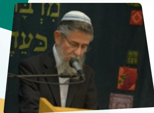
Rav Yitzhak Sheilat