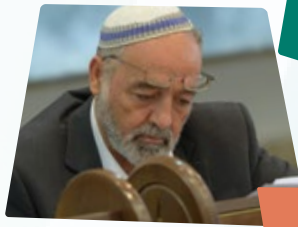
Rav Haim Sabato