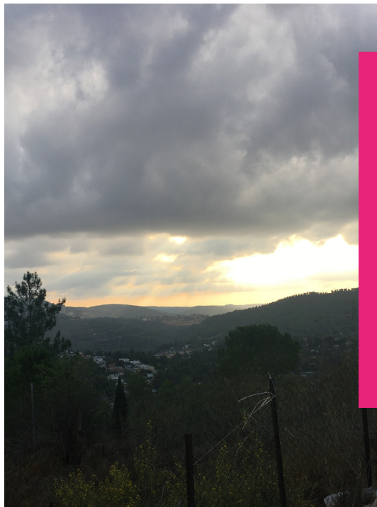
THE VIEW FROM SEM

Being based in Har Nof is the perfect location. We are just one bus ride away from the center of Jerusalem, which gives our girls easy access to the fun places of Jerusalem such as the Shuk, the Old City, and all of the shops on Ben Yehuda.